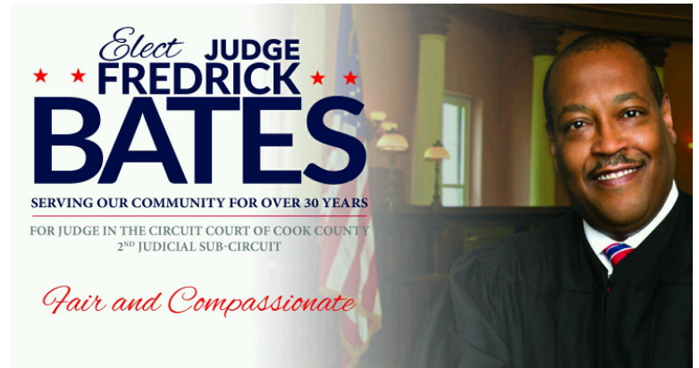
This is a paid for ad. The Pullman Civic Organization does not endorse or support any candidate for political office.