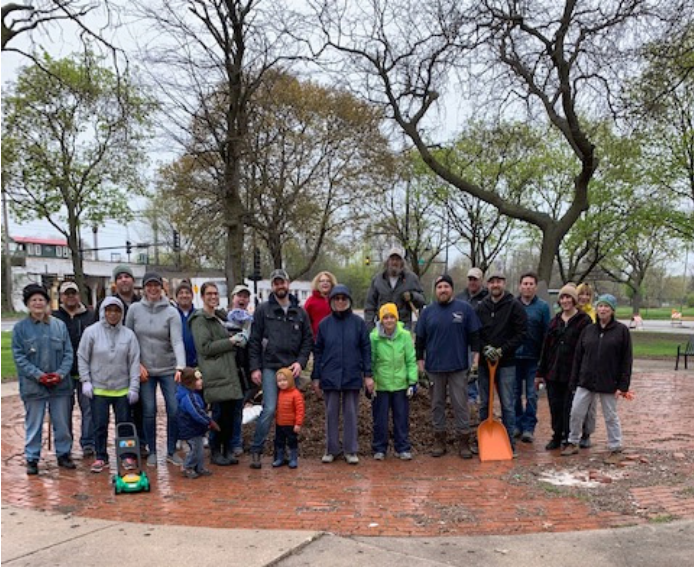
Thank you to our Earth Day Volunteers!