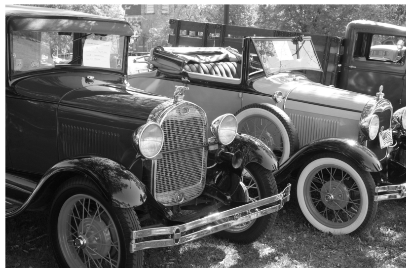
2019 House Tour