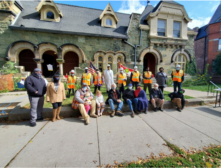
Caption: Greenstone Church - Historic Restoration Campaign and Project Phase