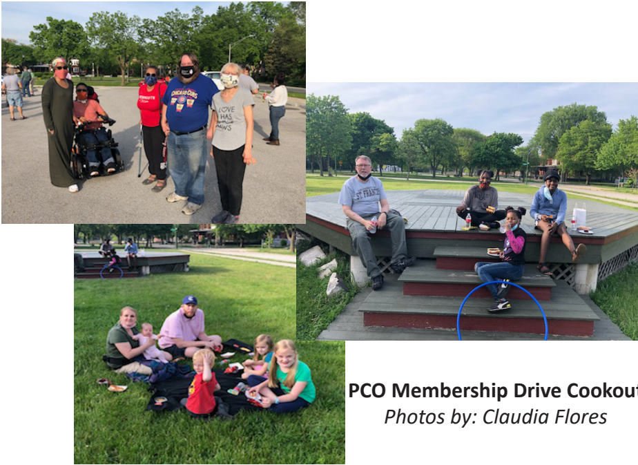
PCO Membership Drive Cookout