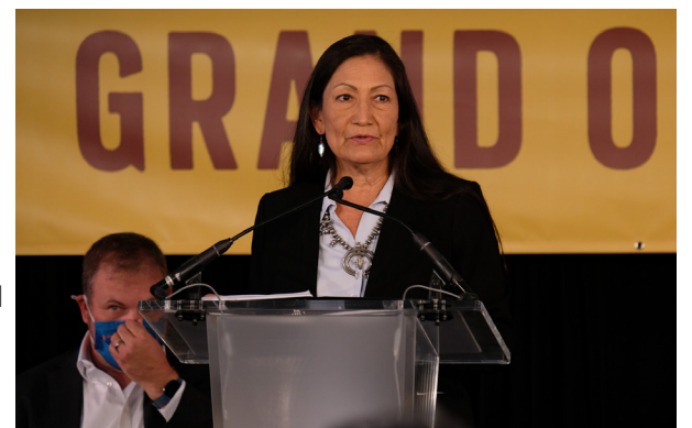
Caption: Secretary of the Interior Deb Haaland addressed the audience at the Labor Day dedication ceremony for the new visitor center and factory grounds at Pullman National Monument & State Historic Site.

Those who missed the event can watch the livestream at Pullman National Monument’s Facebook page. For more information about visiting Pullman National Monument, visit www.nps.gov/pull .