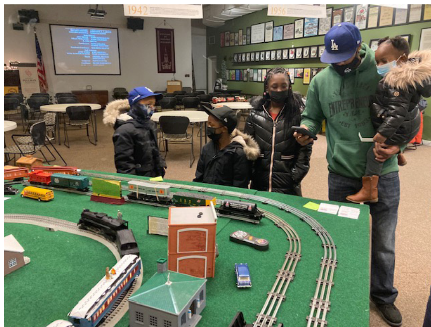
Youngsters watching the Lionel Trains at the Exhibit Hall