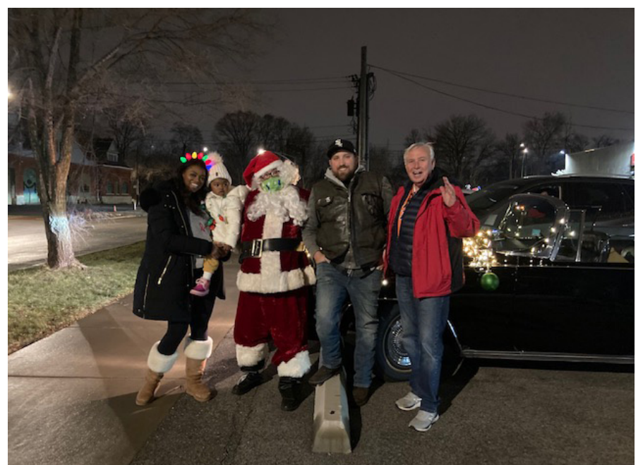
Santa and friends getting ready for the Pullman Car Caravan