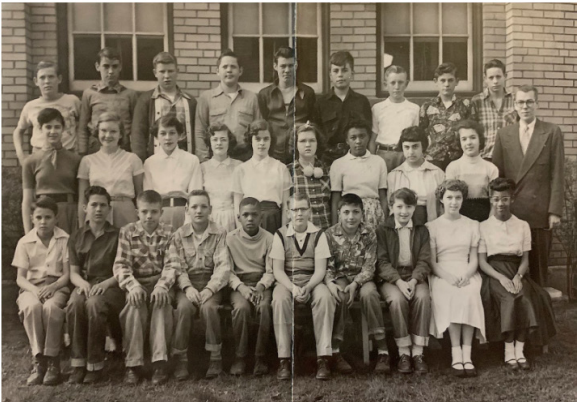
Benton Harbor Class Photo 1954